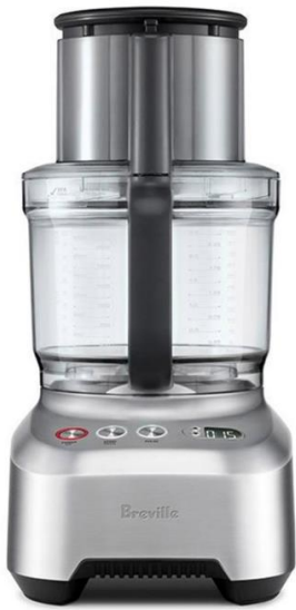
Breville Food Processor