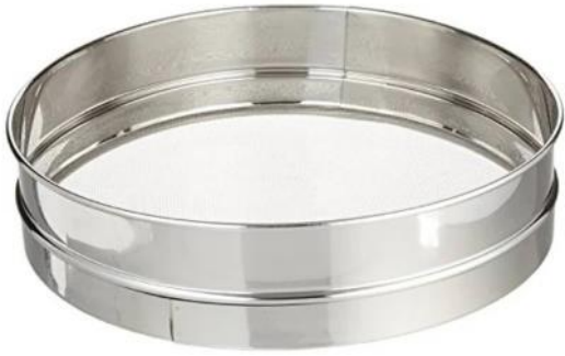
Winco Sieve 12"