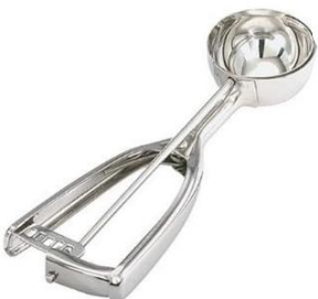
Vollrath Portion Scoop