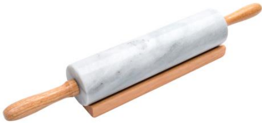
Marble Rolling Pin