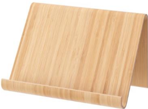
Ikea Tablet or Book Stand for recipes