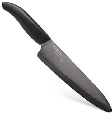
Kyocera Ceramic Knife 7"