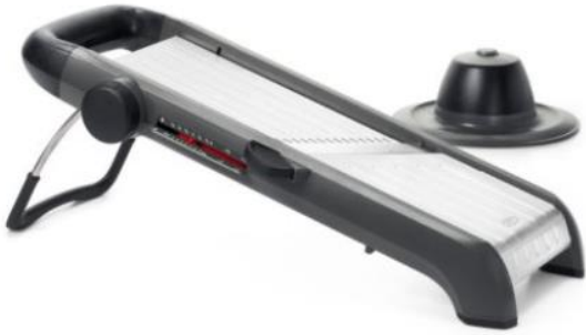
Oxo Chef's Mandoline