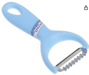
Kiwi Julienne Peeler